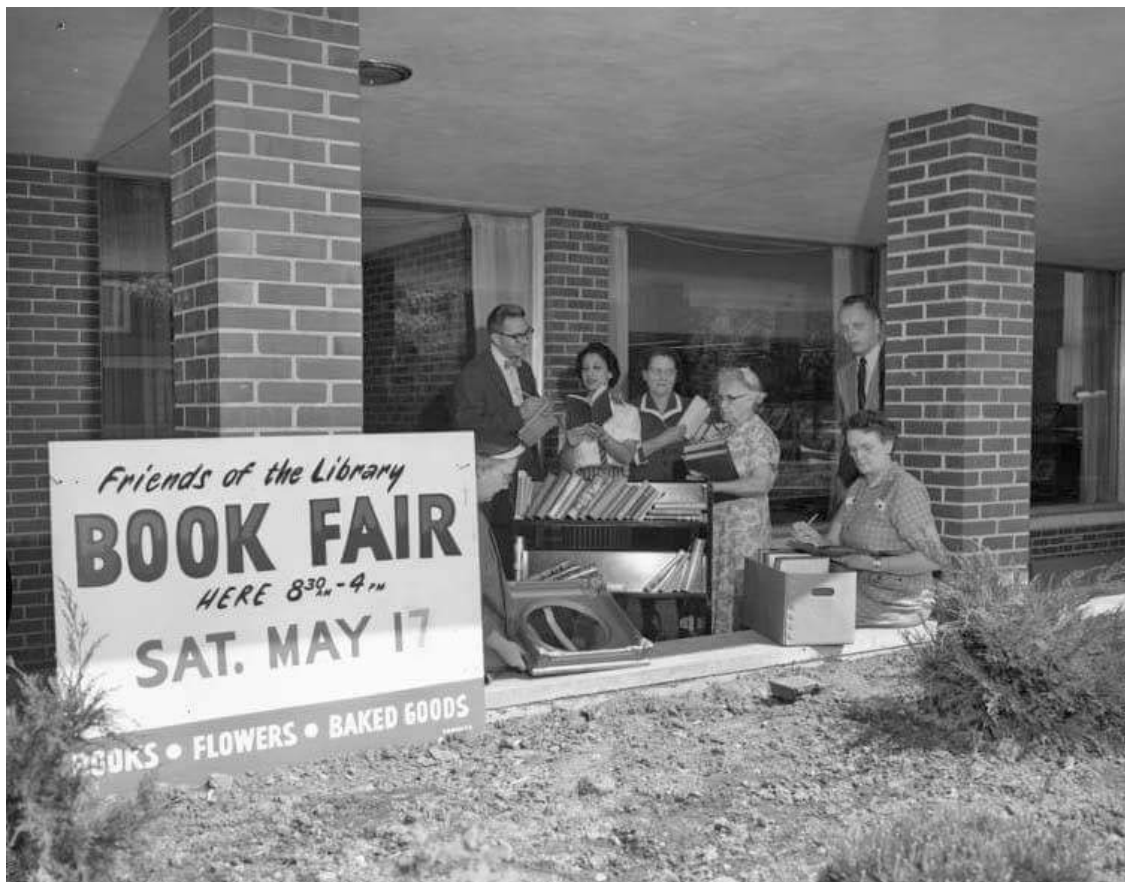
Circa 1958.